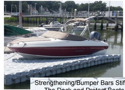
Strengthening/Bumper Bars Stiffen The Dock and Protect Boats

Model 02-1900 _____ 64 Floats Standard Drive on for boats up to 19'