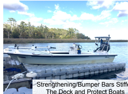
Strengthening/Bumper Bars Stiffen The Dock and Protect Boats