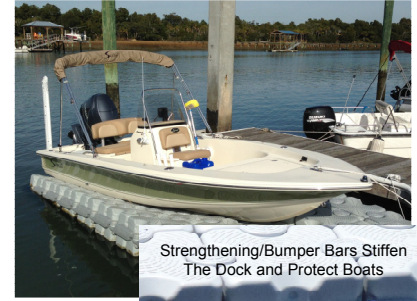
Strengthening/Bumper Bars Stiffen The Dock and Protect Boats

Model 03-2200. 74 Floats Standard Drive on for boats up to 22'