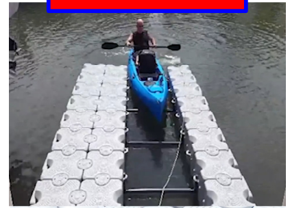
Strengthening/Bumper Bars Stiffen The Dock and Protect Boats